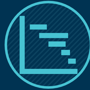
Pro's and con's